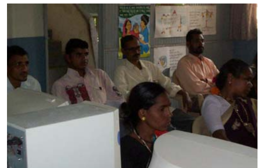
Training of facilitators for CAALP being conducted in Peint

Training of facilitators and supervisors for providing functional literacy to tribal women and adolescent girls has been conducted in Peint, Nasik from 23 rd to 25 th Sept'08. During this phase 10 facilitators and 4 supervisors participated in the training. Following this training 10 more CAALP centres have been operationalized in Nasik taking the total number to 30 in partnership between Tata Consultancy Services, Department of Tribal Welfare, Nasik and local NGO, VACHAN.