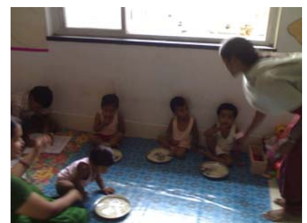
Day Care/Anganwadi centre at Pratiksha Nagar, Sion

Project on Day Care cum Anganwadi centre in construction sites in partnership between Mumbai Mobile Crèches (MMC), Nirman, Integrated Child Development Services (ICDS), B.G. Shirke builders and Bhavishya Alliance has led to major policy change in ICDS. The ICDS Commissioner has issued an order for provision of ICDS services at the big construction sites in Mumbai where the work will go on for 2 years or more and having appropriate number of children in the sites. This is probably the first time ever in India that ICDS services will be reaching to the unrecognised sites with migrant labour.